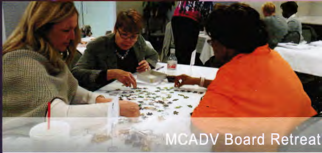
MCADV Board Retreat

MCADV held a two-day retreat/strategic planning meeting for its Board of Directors. The retreat allowed them to get to know each other beyond shelter work, to conduct business not ordinarily accomplished at meetings, and to forge a vision for the Coalition's trajectory.